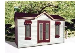
Build to 8' fit bunks on either side