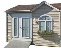
Style with special doors and windows