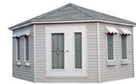
Five sided Bunkie to fit in a corner